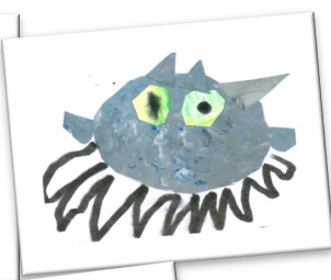
Toothless the dragon