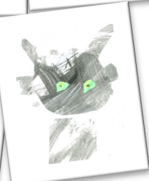
Mog the Cat