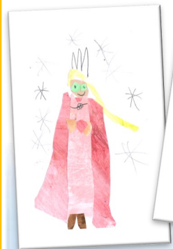
Ida from the Snow Sisters