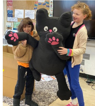
Our giant Jigsaw Jerrie that we received as part of our flagship status!

We are delighted to announce that St Levan has been awarded Jigsaw Flagship Status. We have been recognised as successfully implementing and teaching the Jigsaw PSHE programme of work