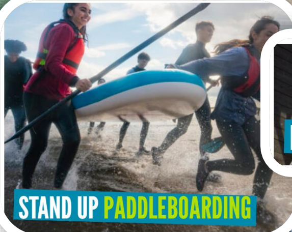
STAND UP PADDLEBOARDING