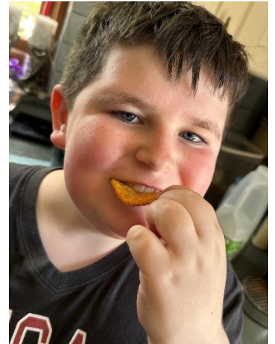
Me eating it