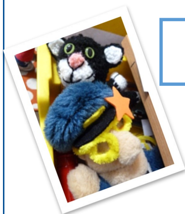
A happily reunited Postman Pat and Jess

We were so delighted (as was Pat) that we subsequently made 'Found' posters- you may have seen these too!