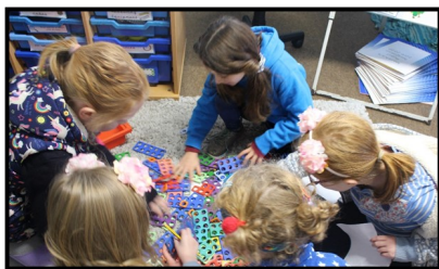
Team work finding answers to the Maths Trail